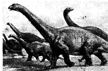
Prehistoric victims of a strike from space?

That could mean a direct hit or, more probably, another nerve-jangling near miss. But even if 1989FC never strikes earth, a similar asteroid is destined to do