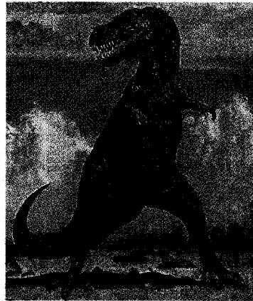
Last of the Cretaceous: up in smoke

Disaster began when the celestial intruder crashed into what is now the Bering Sea, possibly creating a crater