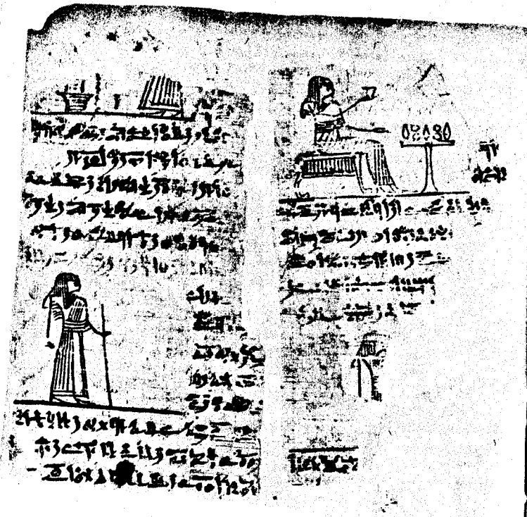
Photographically reduced from the 6" x 6" original